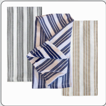
ONE SIDE TERRY (REVERSIBLE)