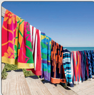
JACQUARD BEACH TOWEL (SHEARED VELLORE WASH)