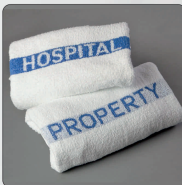
LOGO/ HOSPITAL TOWELS