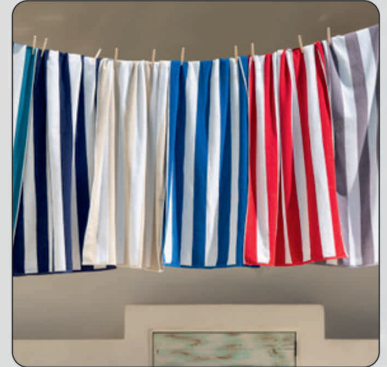
CABANA / POOL TOWEL