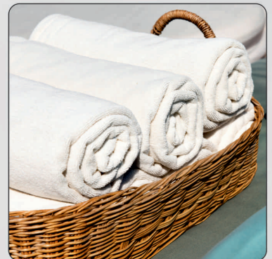
PURE WHITE TOWELS (TOWEL SETS ALSO*)