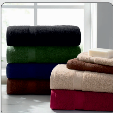
SOLID VAT DYED