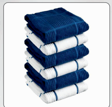
KITCHEN TOWEL / NAPKIN