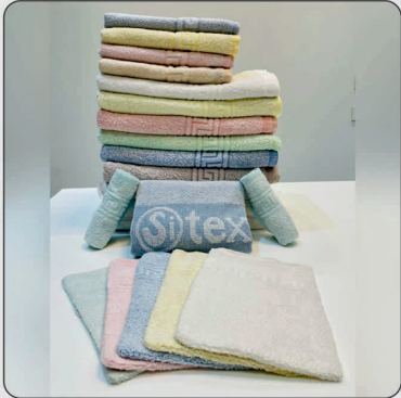
GREEK BORDER / GLOVES